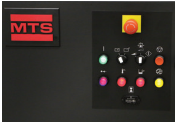
Easy-to-use control panel

Minimum ambient operating temperature: 5°C (40°F)