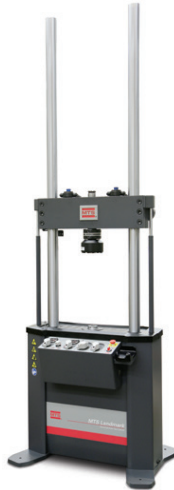
MTS Landmark 370.10 Load Frame

Specifications subject to change without notice. Please contact MTS for specifications critical to your application.